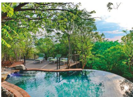
CLOCKWISE FROM LEFT: Palm River Hotel; Pioneers Victoria Falls; Victoria Falls Safari Lodge

into town. If your taxi driver arrives late and says, "Sorry, there was an elephant on the road," he isn't lying.