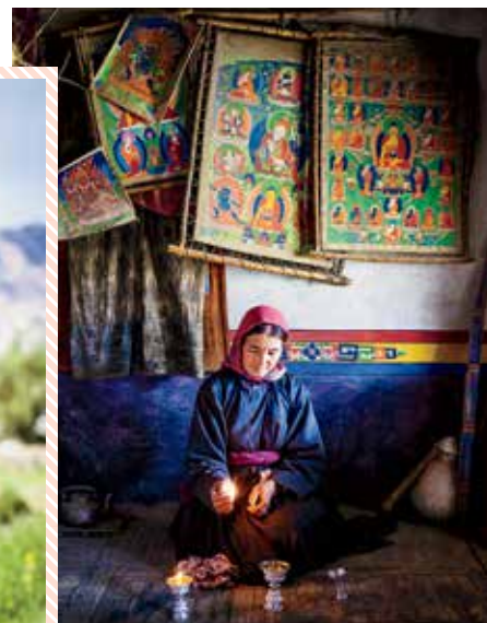
From left: high on a hill near Ladakh's capital of Leh sits the Thiksey Monastery, a 12-storey complex with ten temples; a traditional dancer at Chamba Camp Thiksey; a Nubran woman lights butter lamps in her family shrine in Kheyma village, in Nubra Valley

High up on the Tibetan Plateau, the remote, mountain-wrapped former Buddhist kingdom of Ladakh is increasingly drawing travellers to its exhilarating landscapes and spiritually uplifting sights. Visits to venerable monasteries filled with crimson-robed monks are the high point, but that doesn't mean it has to be a hair-shirt experience. From mid-June to mid-September, The Ultimate Travelling