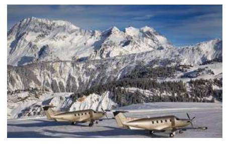
The world's best plane landing?