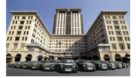
The world's most luxurious hotel transfers