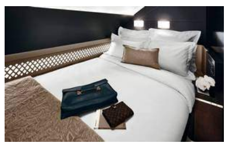
Life in fabulous first class

Why start in Orlando? Because it's easy to