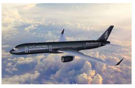
Joining the private jet set