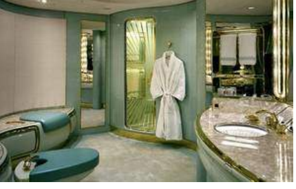
Private jets' incredible interiors