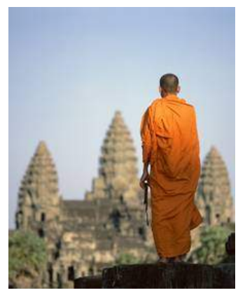
Admiring the view in Angkor Wat Enlarge

Is it exhausting? No, because all the dreary bits are removed. At the airport we use private terminals or just march straight through the departures hall. Our bundle-of-laughs "first lady of luggage" fills in all the landing cards. Somehow, my suitcase gets beamed from my over-water bungalow in Bora Bora to my rainforest-wrapped suite in Far North Queensland without my